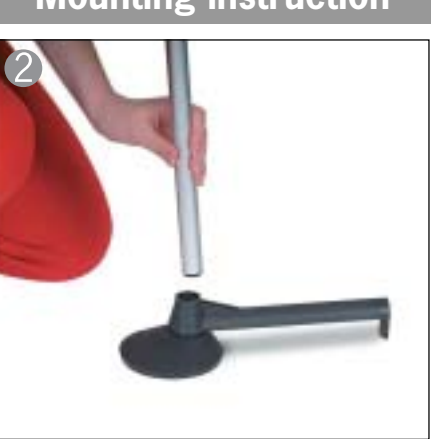
Attach pole to base