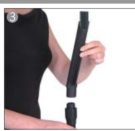
Attach top rail support