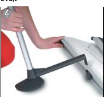
Attach bottom rail