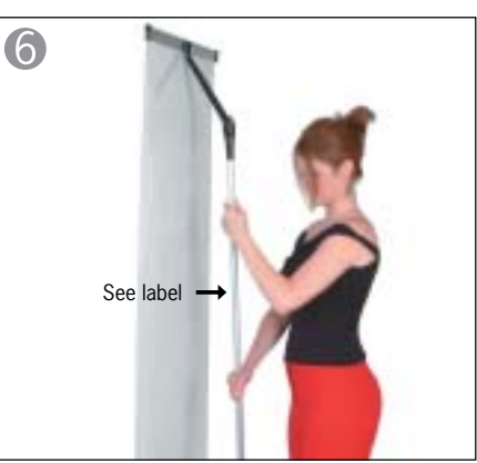
Raise top section of pole to apply tension, twist anticlockwise to lock in place (clockwise to unlock).