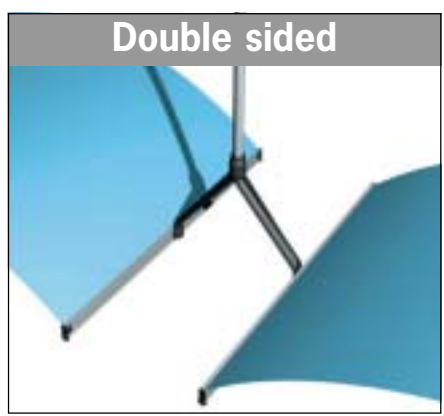
Double sided display uses 2 rail supports on bottom instead of base, as well as 2 rail supports on top.