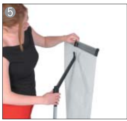
Attach top rail