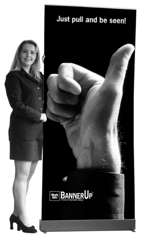
Assembly instruction Original model